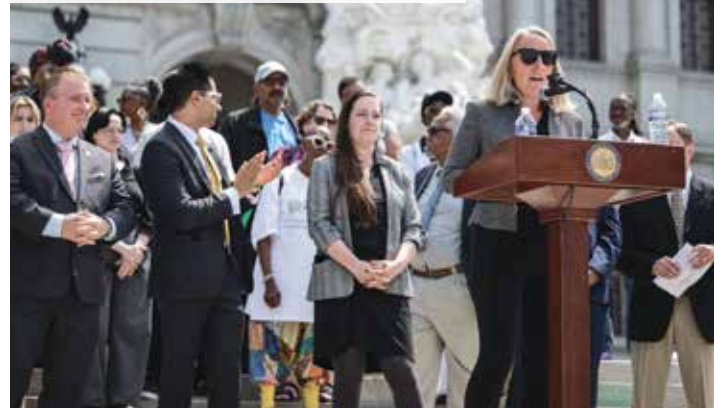
Generating support for banning toxic driveway sealants in Pennsylvania.

With more driveway sealants available that are safer for public health and the environment, we should eliminate the sealants that are toxic.