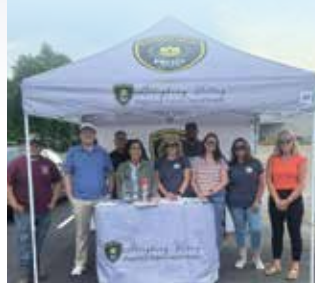
Illegible License Plate Event with Allegheny Valley Regional PD