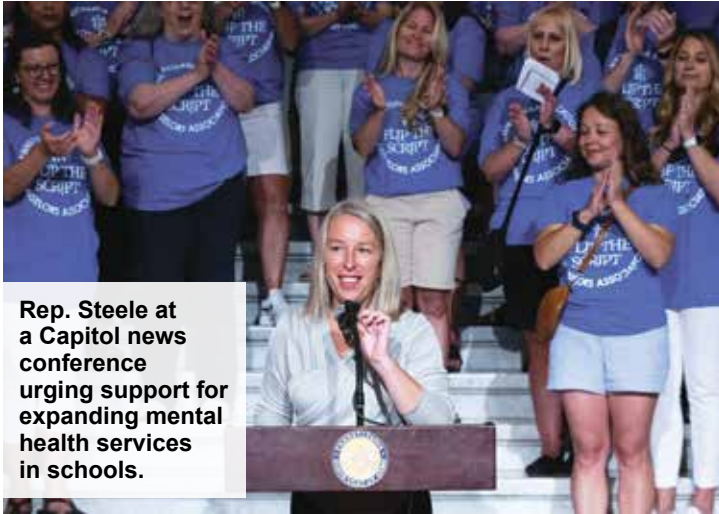
Rep. Steele at a Capitol news conference urging support for expanding mental health services in schools.

As the mother of four children, I worry about their mental health, just like many parents. This bill would prioritize students' mental health and well-being to help them better meet life's challenges with greater resilience.